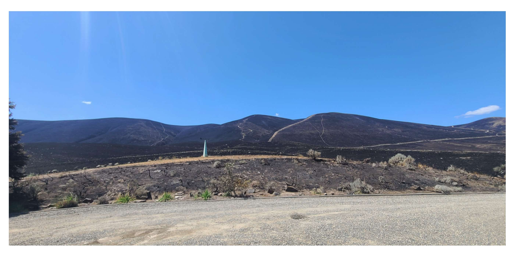
Burned north facing slope on McBee Grade a day after the fire – June 14, 2023.