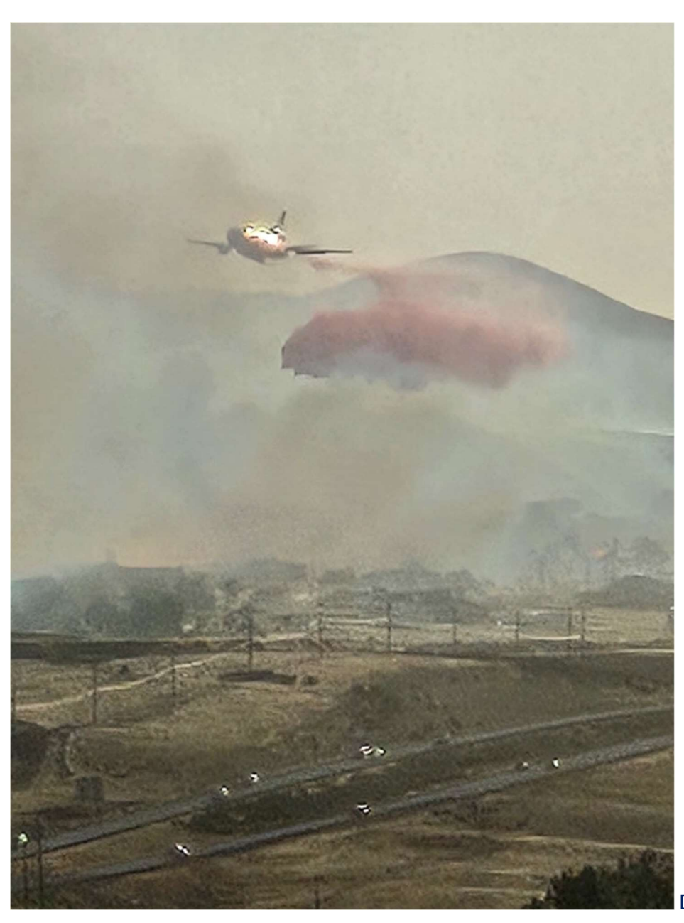
DC 10 dropping fire retardant on my property on June 13, 2023.