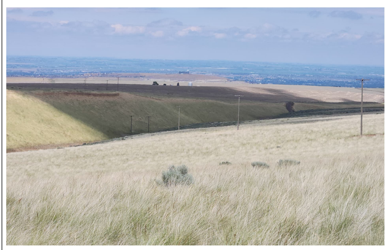
3.pict#3+#4 Section 7/T7N/R29E 46°5'56.53"N 119°13'41.23"W

I am voluntarily supporting and coordinating with the local community non-profit organization Tri-City CARES. I am here to share my concerns about the impacts the Horse Heaven Hills Project will have on my home, property values, and the other homes in my neighborhood and other similarly situated neighborhoods in Tri-Cities. I