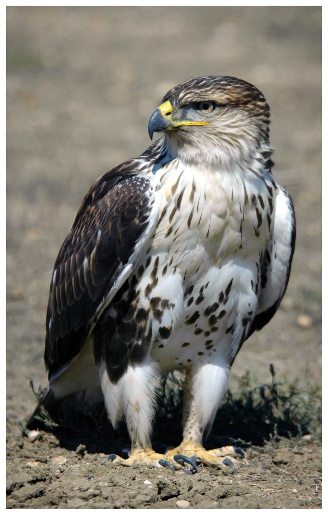
A ferruginous hawk.

To protect the hawk, Washington's Energy Facility Site Evaluation Council, or EFSEC, will consider removing more than half of the project's proposed turbines, marking a victory for ecologists who petitioned for the changes but a substantial defeat for the Colorado developer behind the project and a delay for this state's renewable energy goals.