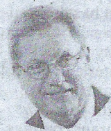
BY JIM CONCA

A company out of Boulder, Colorado, called Scout Clean Energy has applied for a permit to build a massive turbine wind farm in Washington State on the Horse Heaven Hills, extending from the town of Benton City, through the Tri-Cities, to the town of Finley. The wind farm will have upwards of 250 turbines that are 500 feet tall and cover about 6,500 acres (over 10 square miles):