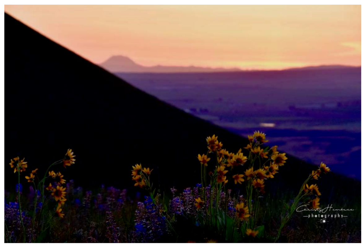
Lupine and Balsam root flower with Mt. Adams at sunset on the Horse Heaven Hills. Is this view worth sacrificing for a Windfarm project that doesn't even benefit us locally. Scout Energy seems to think so, but they do not live here. Why aren't locals being given the right to decide?

Our ridges are well-loved by local residents: maybe a little too well loved in places, as ORV tire tracks, target shooting shells, targets and clay pigeons, and litter have become a perennial problem. Unfortunately not everyone who love recreating on the Horse Heaven Hills and other ridgelines in our area, are aware just how fragile the shrug-steppe, and especially ridge-top plant communities, are; and how susceptible to harm by vehicle use, litter, and heavy traffic.