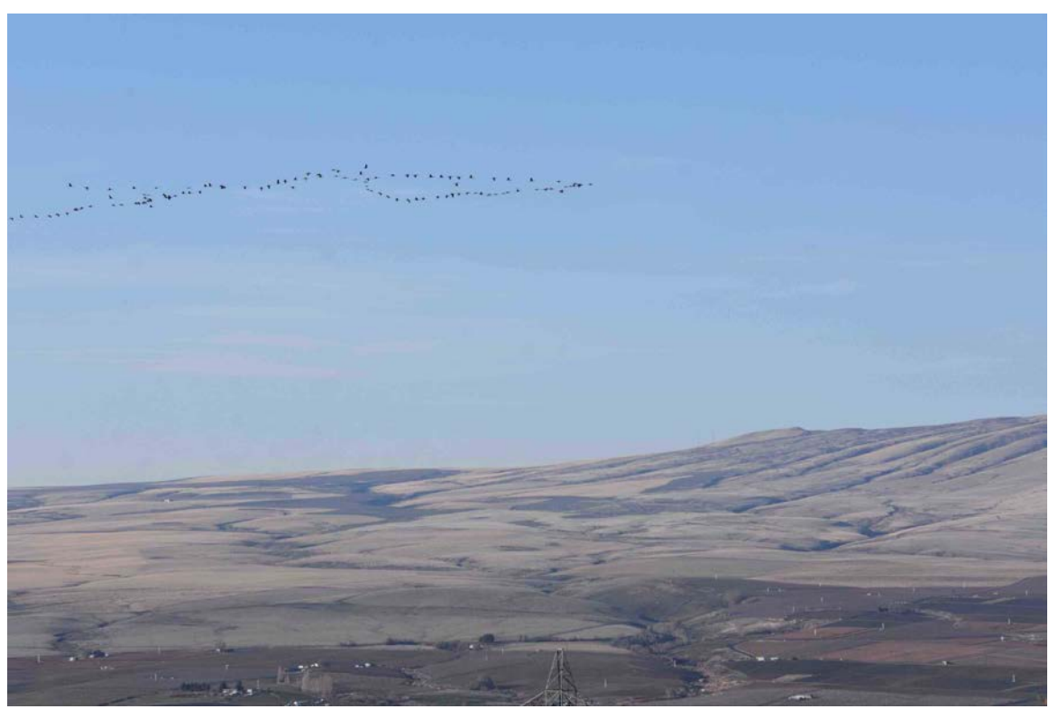
Sandhill Cranes using thermal updrafts from Horse Heavens and Rattlesnake Ridge during their long migration journeys. These same updrafts are also known and used by other species of birds like hawks and falcons, for hunting and travel, as well as recreationally by hang-gliding and paragliding enthusiasts.

Wind Turbine's spinning blades kill over half a million birds per year and more bat species. Scout Energy claims their wind farm project is a boon for the state, yet it will directly cause many annual bird and mammal deaths, disrupt bird flyways, degrade intact shrub-steppe ecosystems, and create wind turbine syndrome in humans and nearby livestock, (and by extension, in wild animals living there). Clearly, saying the Scout Energy Wind project benefit our area is a downright lie.