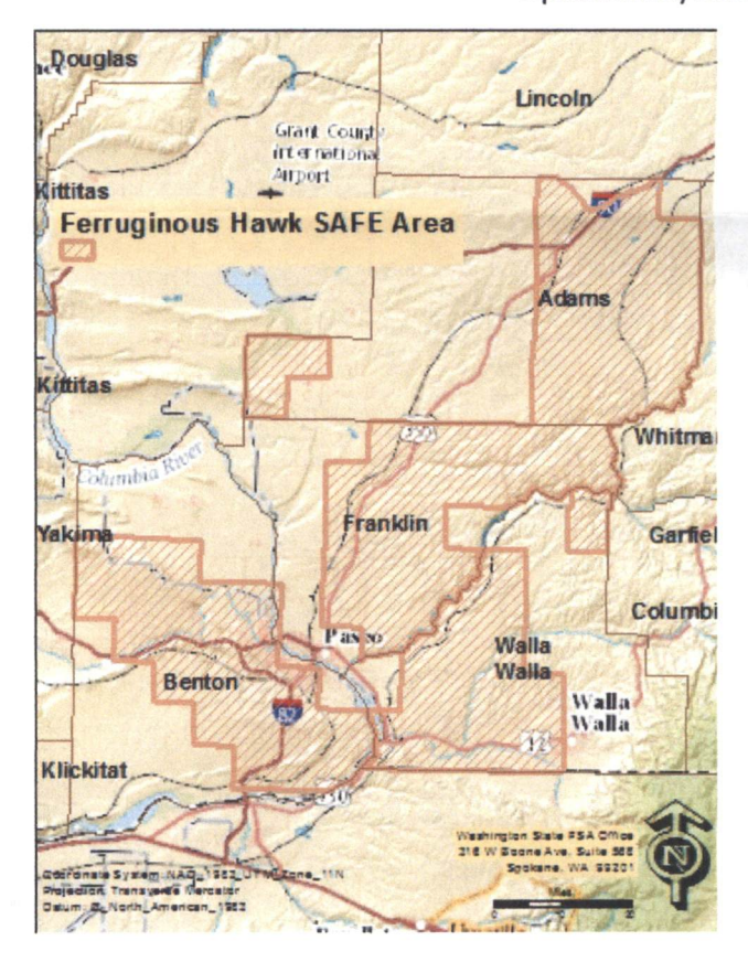
Ferruginous Hawk Project SAFE Area

Ferruginous hawks primarily forage in territory around their nesting sites. Hawks are also sensitive to disturbance near the nest. Therefore, land enrolled in SAFE must be near potentially active nests and planted to grass, broadleaf forbs and shrubs that provide quality wildlife habitat.