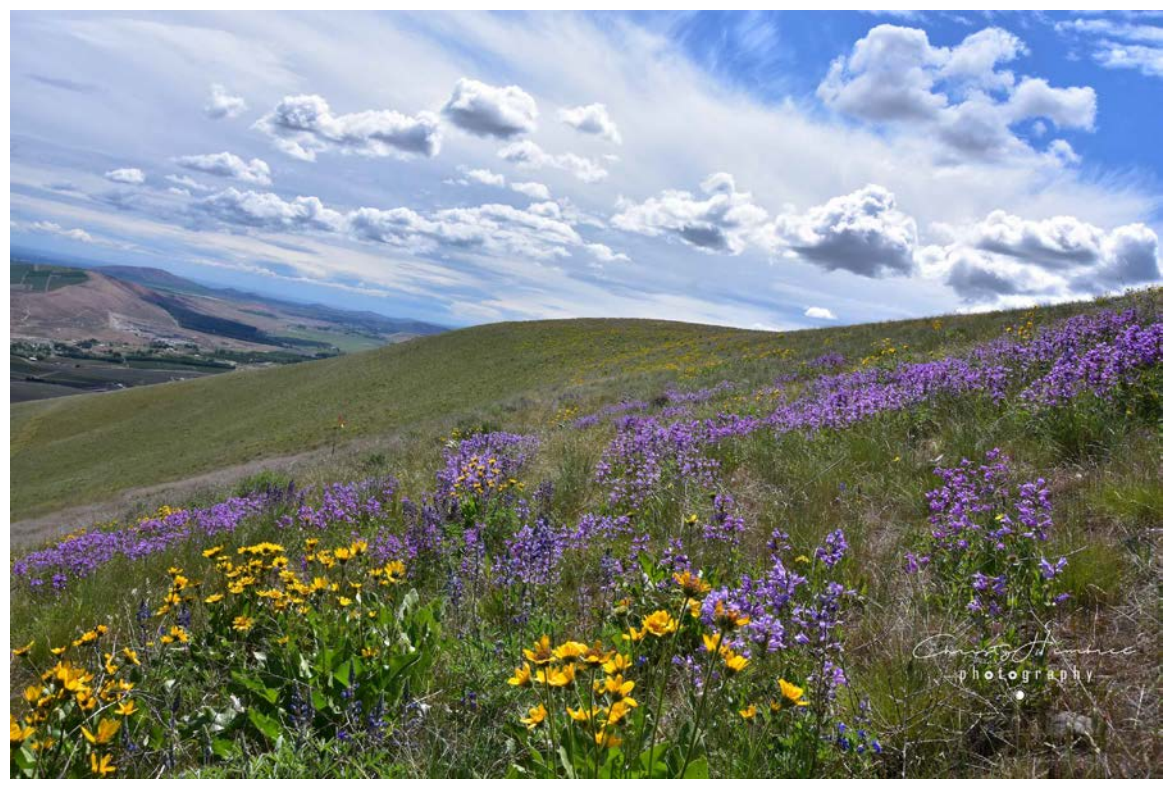
Many flower species provide pesticide- and herbicide free food sources for bees, butterflies, insects, and other pollinators during the spring season as well as inspiration for hikers along the Horse Heaven Hills.

To get an idea of just how pristine our ridge lines really are, one only has to visit hillsides or sagebrush-bunchgrass communities that have been disturbed by fire, development, agriculture, overgrazing, etc. There one sees erosion, invasion of exotic and undesirable species like tumbleweed, cheat grass, thistle, puncture vine, and the like. One also notices the dearth of native plant diversity and crytpogamic crust. That is the mycrophytic crust layer, made up of lichens, algae, cyanobactieria, and fungi. The crust preserves soil moisture and creates small open spaces between native grasses and shrubs. This microphytic crust layer is not unlike the good-bacteria in your gut. Losing the good bacteria in your intestines creates all sorts of health havoc in your body. Similarly, once the microphytic crust layer is gone from the ecosystem, invader species get established and create a stranglehold, and native plants soon perish and ecosystem integrity is lost. This will happen with a Wind farm