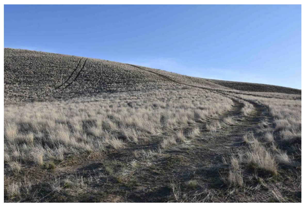
An example of "light traffic" off-road vehicle use by vehicles driving where they are not supposed to be. The permanent destruction by a large scale wind farm project will be catastrophic in comparison.

This is a problem that is solvable and can be remediated; and is nothing compared to the destruction that will be cause by Scout Energy's large-scale wind turbine project. A wind farm of this scale will be catastrophic, unrecoverable, and untenable. And for what? For a small contribution of electricity that will not even benefit the Tri-Cities area. For a small boost of jobs during its building phase, most of which will be eliminated soon as the installation is finished. The Horse Heavens Wind Farm Project will create a trail of destruction on the local hillside wild lands; with no guarantee of remediation once the short life cycle of the wind turbines is completed. And then the wind towers will become derelict eyesores and a reminder of a project that never should have been approved in our area.