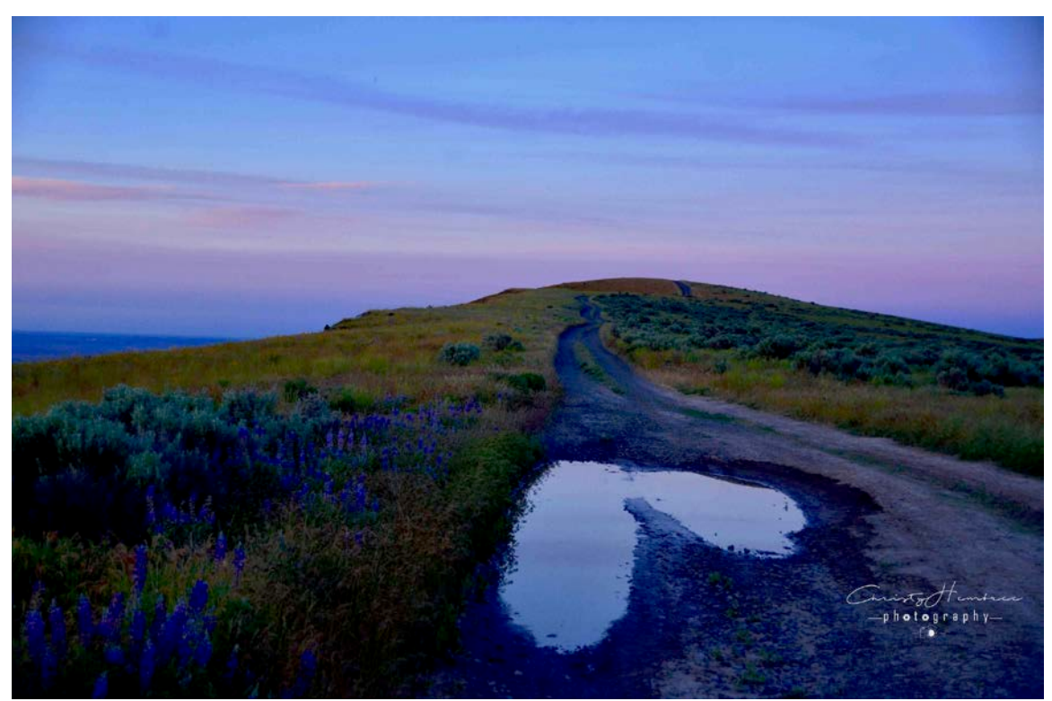
Horse Heaven Hills, after a rain, with Lupine at Sunset. Horse Heaven's and other ridge complexes in our area represent the heart and soul of our wild shrub-steppe landscape and are beloved by many visitors and residents alike.