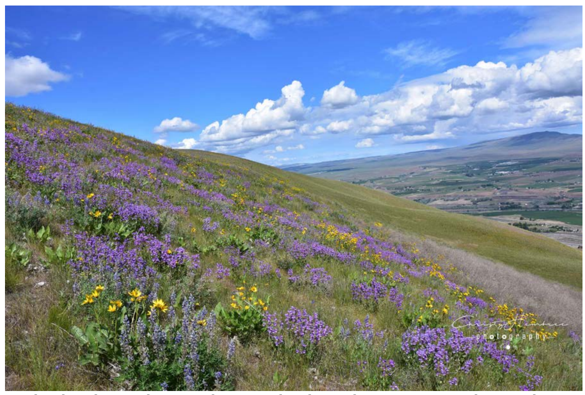
Bright Blue Skies and Native Flowers: A heady combination. Native plants and animals belong on our ridgelines. Wind turbines do not.

unreliable wind energy. Calling it "green" if it depends on coal during wind slack times is another outright falsehood. In our area, it would be displacing the hydro/nuclear energy suppliers, which are already in place, virtually carbon neutral and do not threaten the ecologic integrity of our local ridge lines.